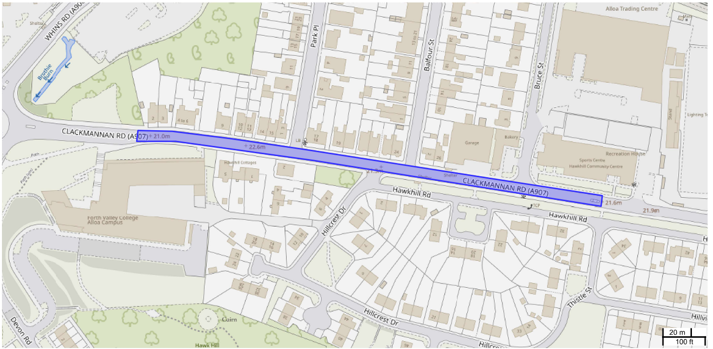
A907 Clackmannan Road, Alloa