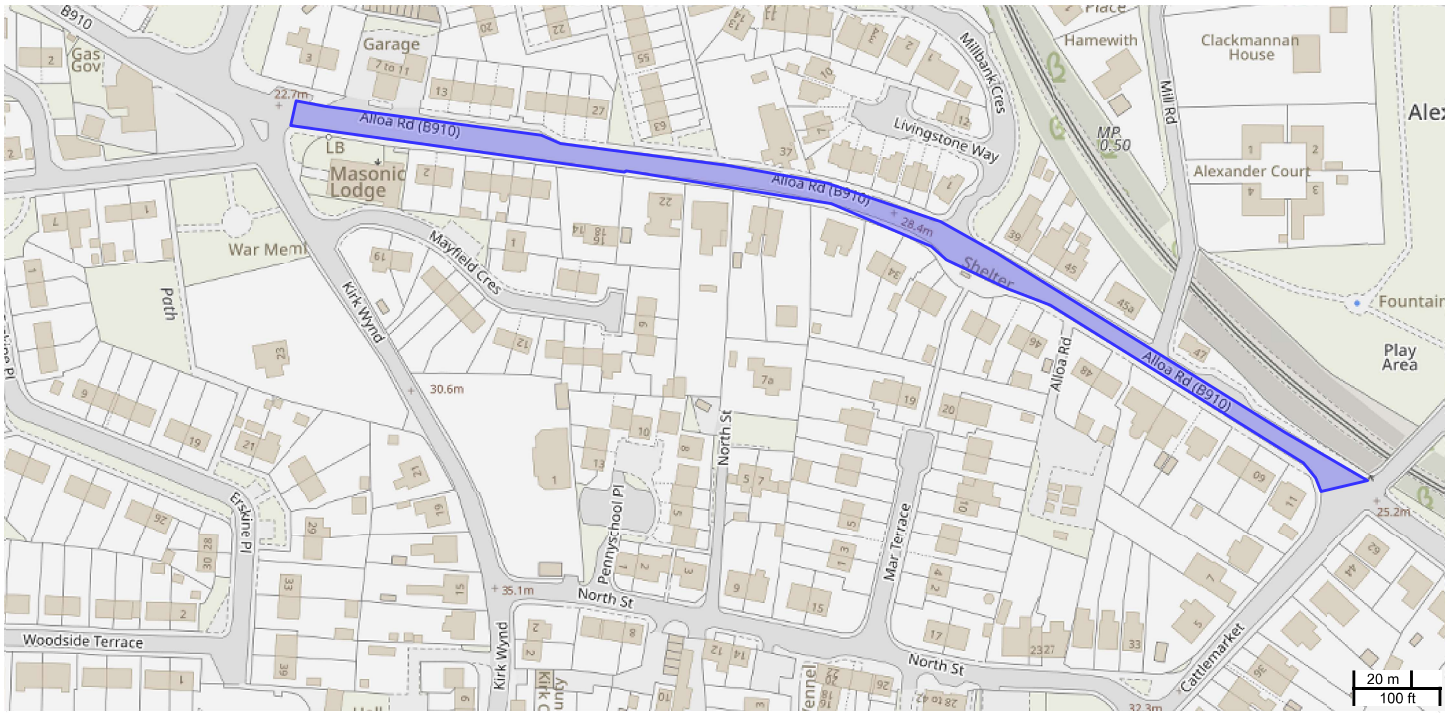
B910 Alloa Road, Clackmannan