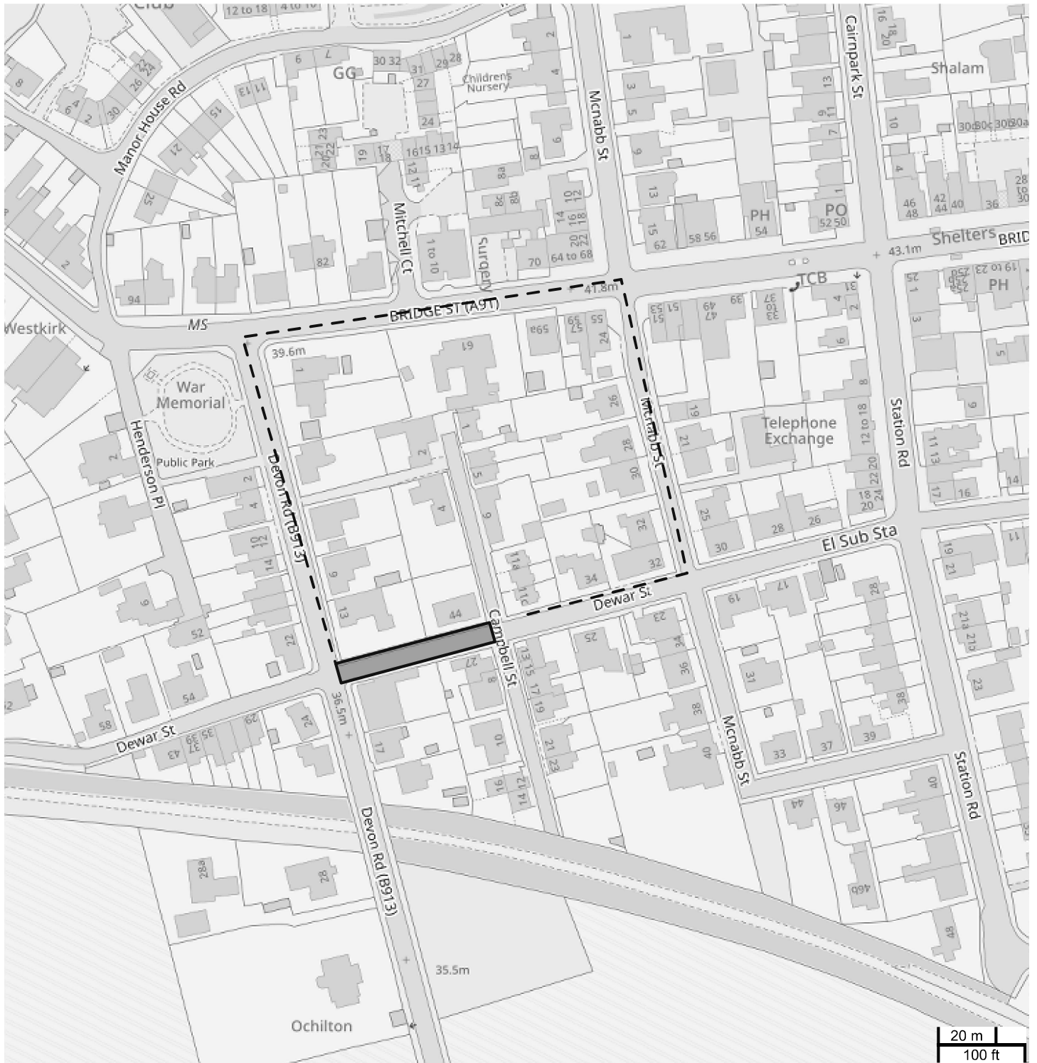
ETRO2025_001 Dewar Street, Dollar - emergency closure