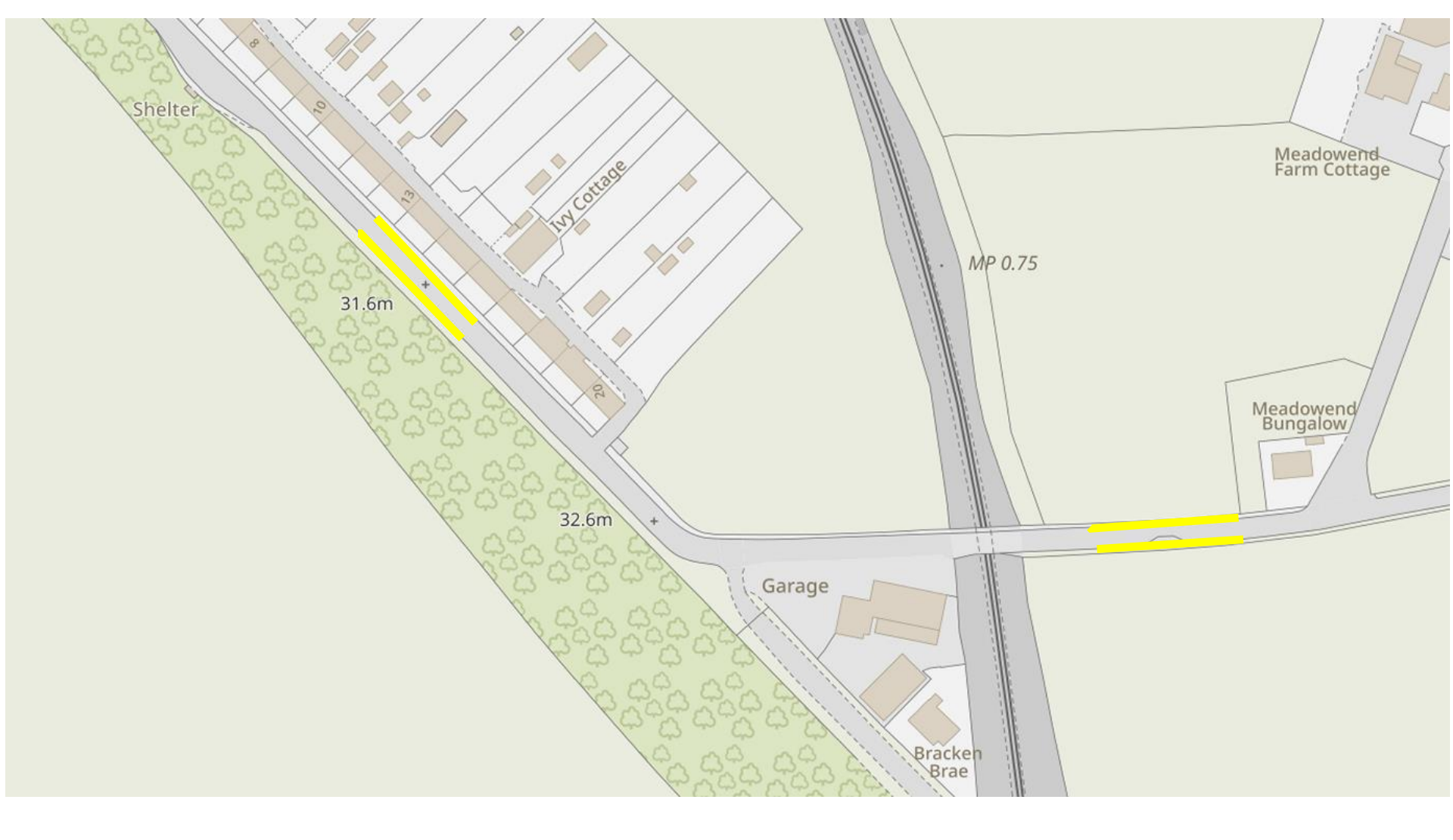
PTRO2024_008 plan 2 Waiting Restrictions