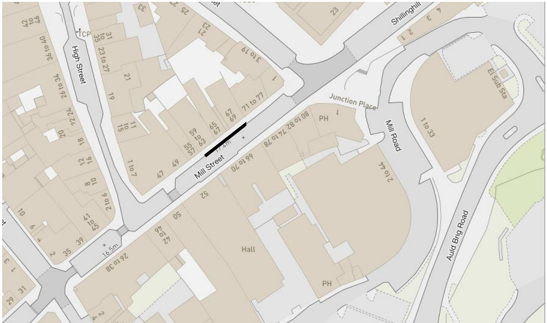
TRO2022_066 Mill Street, Alloa - Parking Suspension - Schedule 2 05/09/2022 - 23/09/2022 - SGN works