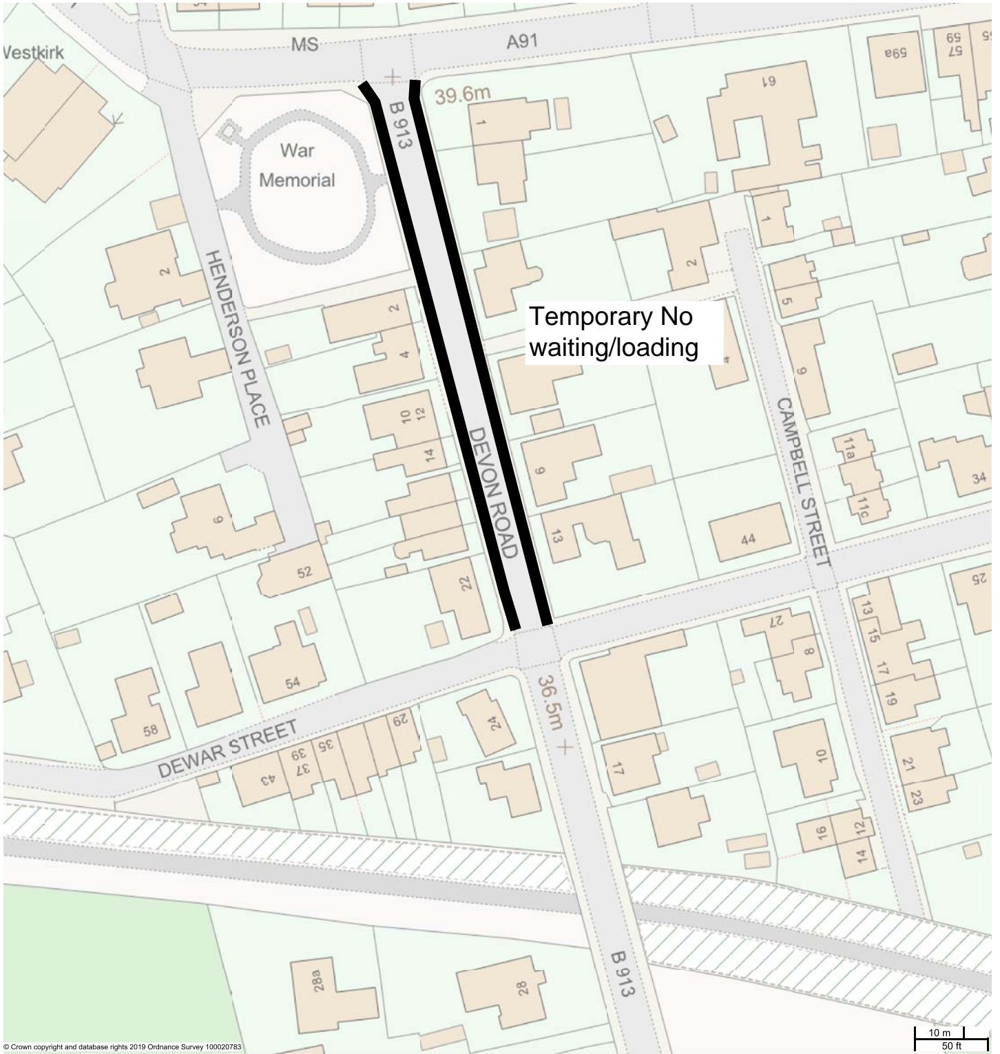
TRO2021_046A - B913 Devon Road, Dollar