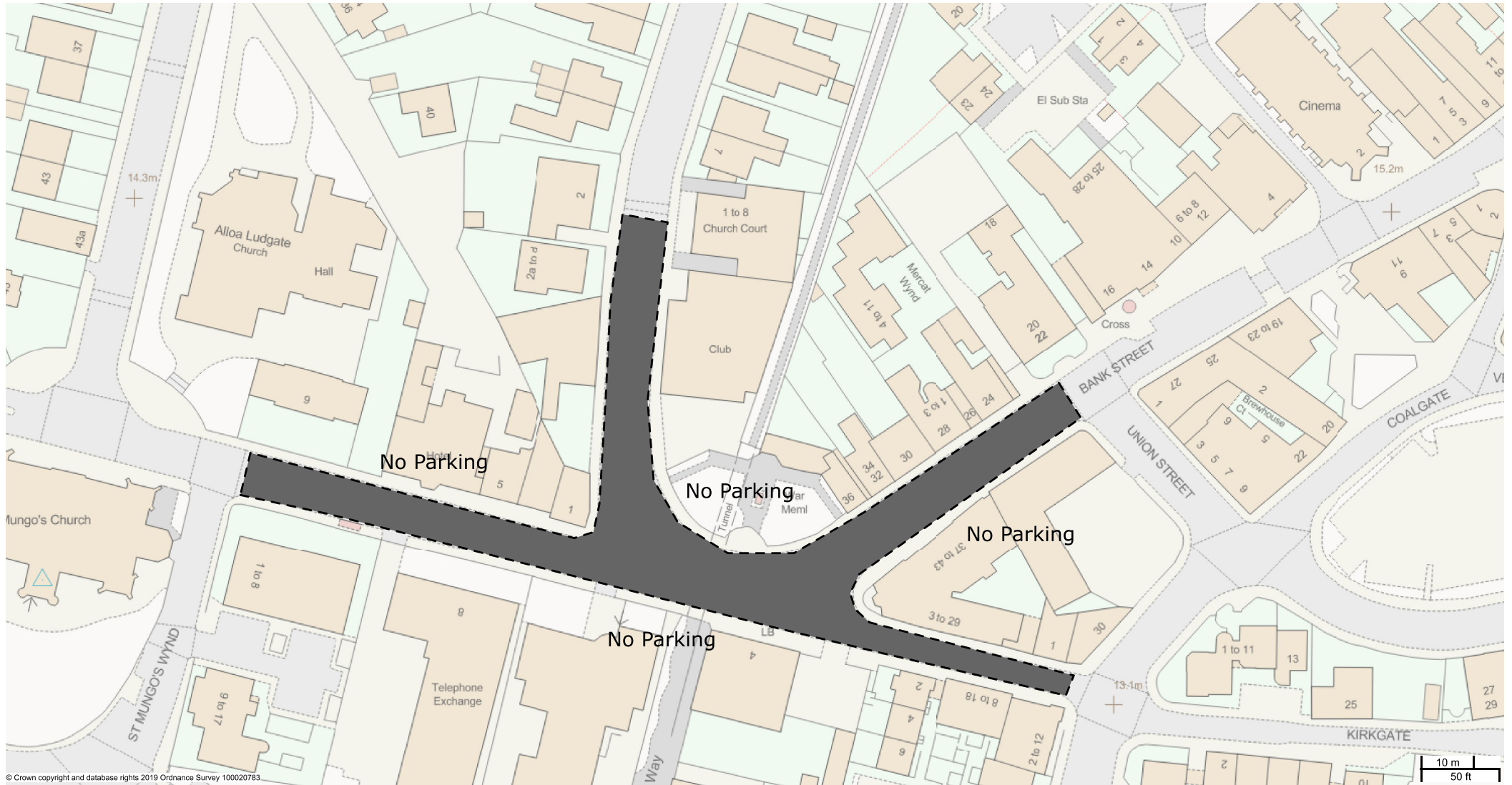
Alloo Remembrance Day 2019 No Parking