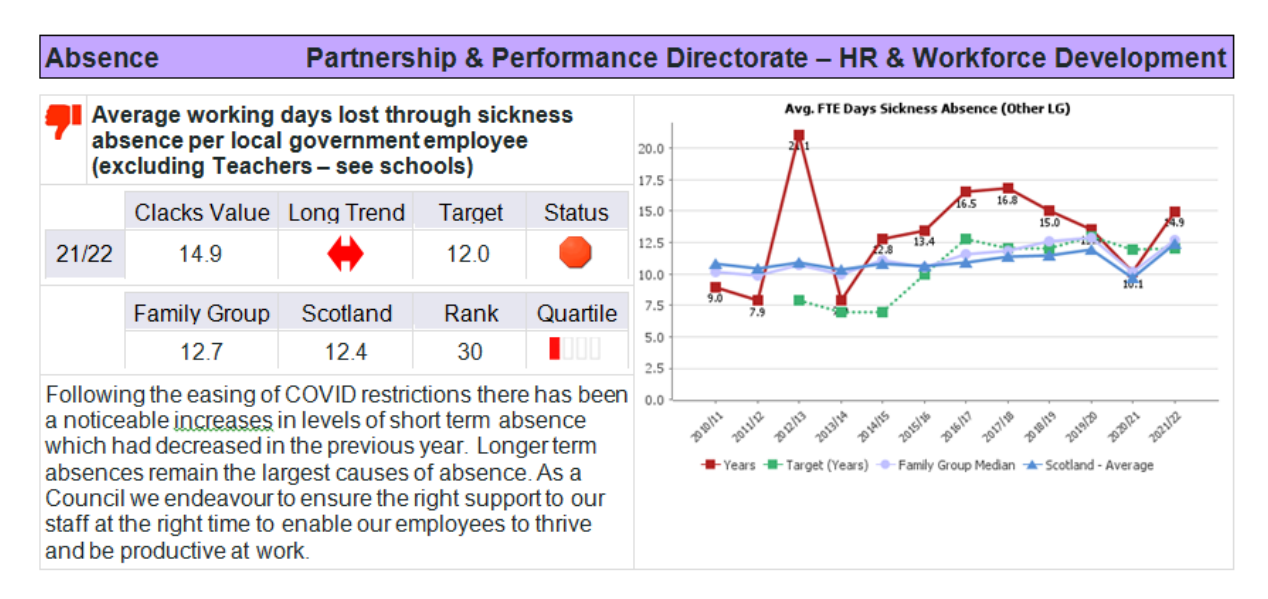
Table 1 – Average FTE days lost per local government employee (Extract LGBF Annual Report 2021/2022)