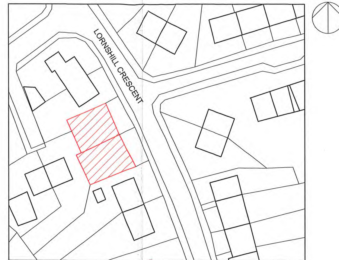
SITE PLAN 1:1250