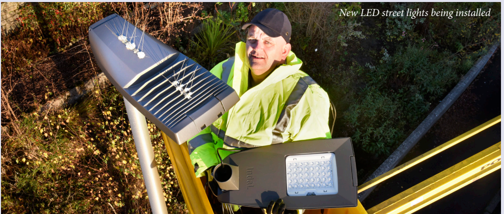
New LED street lights being installed

If you are interested in seeing the new LED lights in operation, you can visit Branshill Park or The Hennings in Sauchie where we installed new lights in 2013.