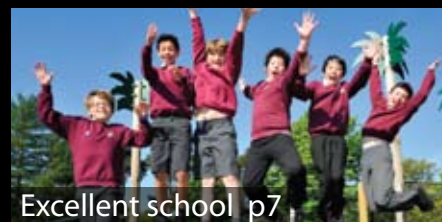
Excellent school p7