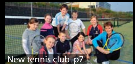
New tennis club p7