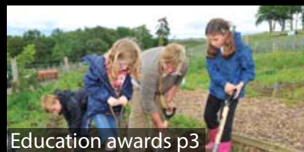
Education awards p3