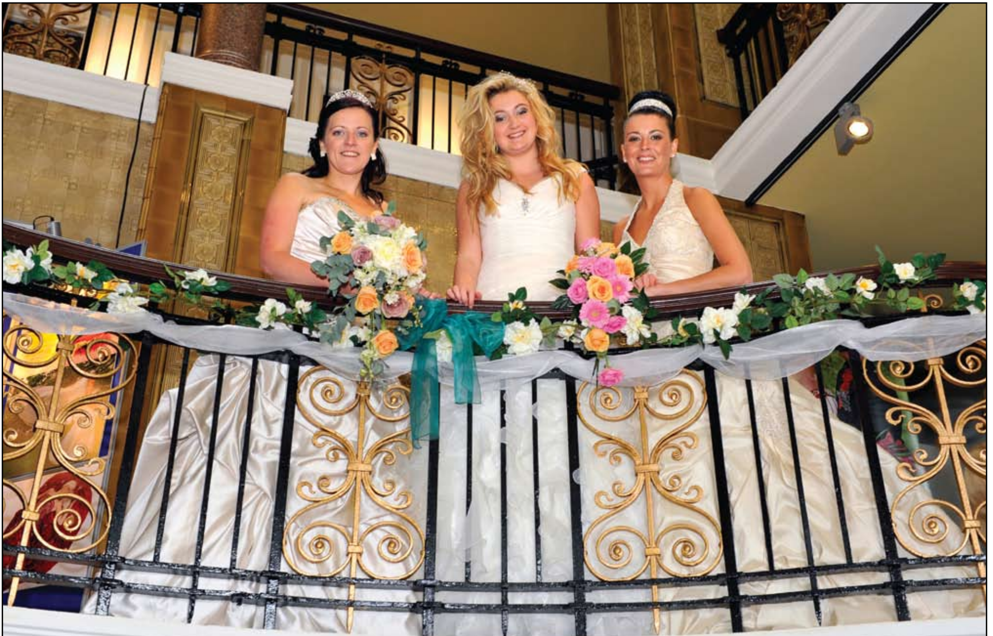
Wedding belles grace refurbished town hall

Clackmannanshire Council www.clacksweb.org.uk