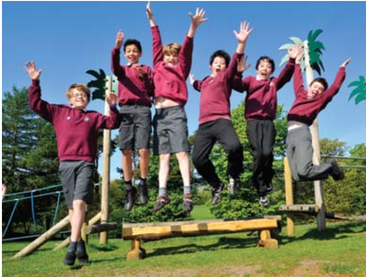
Muckhart is a primary school with high attainment levels where children really enjoy their learning, according to a report by HM Inspectorate of Education.

The school received two 'Excellents' and three 'Very Goods' for the five aspects the inspectors evaluated. To receive two 'Excellents' is exceptional and these were given in the areas of 'improvements in performance' and 'learners' experiences.' An 'Excellent' rating means that the school has been recognised as sector leading.