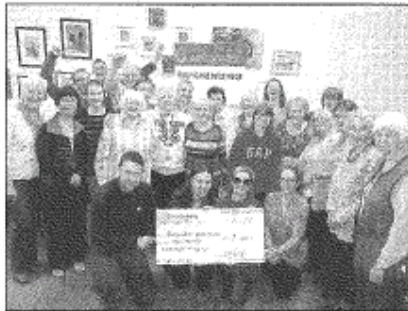
The cheque hand over

RESONATE Arts House in Alloa has received a £7,000 award from the Coalfields Regeneration Trust's Coalfields Community Investment programme to help pay for someone to run their print and design business. Resonate runs a multi-faceted arts and crafts facility in Alloa, offering a wide range of opportunities and activities to service users of all ages and abilities. As well as crafts classes the group operates personal development sessions on assertiveness, creativity, relaxation and self-esteem. Their programmes include a business start-up club run in conjunction with the business and economic unit of Clackmannanshire Council. Resonate also runs a printing and design service, serving local clients and Signpost, CVS Falkirk and CEIS Glasgow. A print worker is required to take on the full-time running of the business