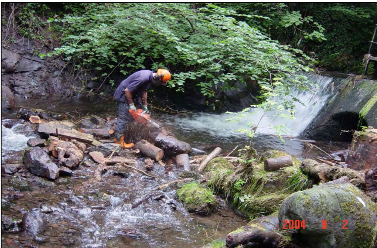
Photo 1 - Council staff carrying out dead wood debris cutting in Alva Glen