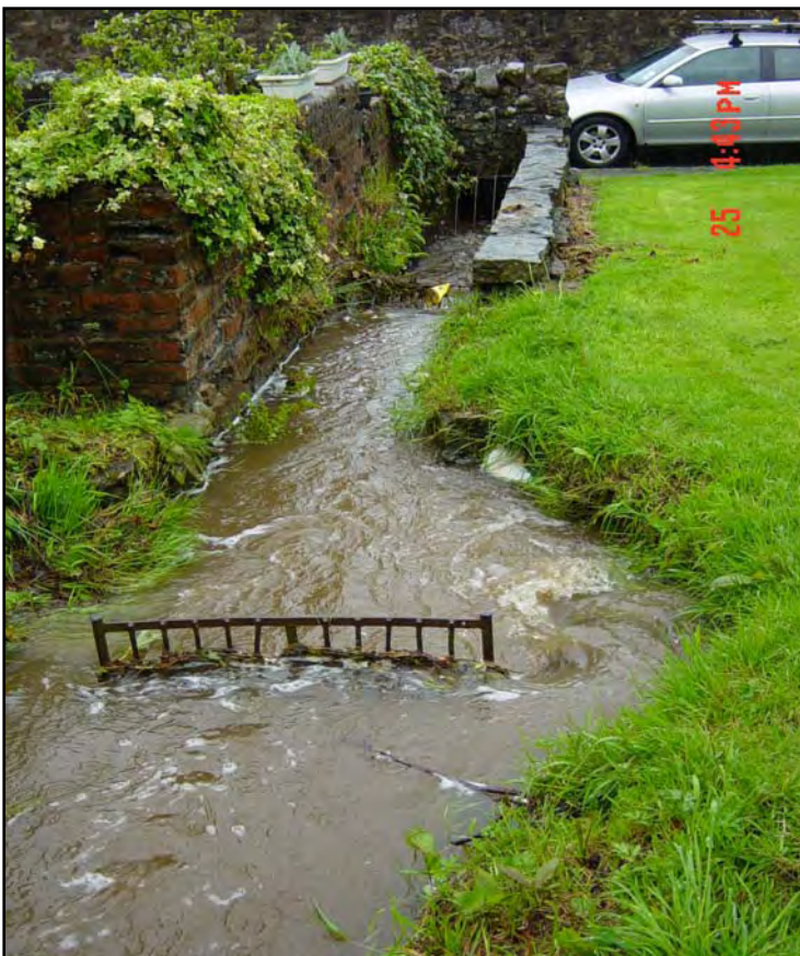
Photo 9 - The burn at Thornbank Road, Dollar looking west - 25/05/05