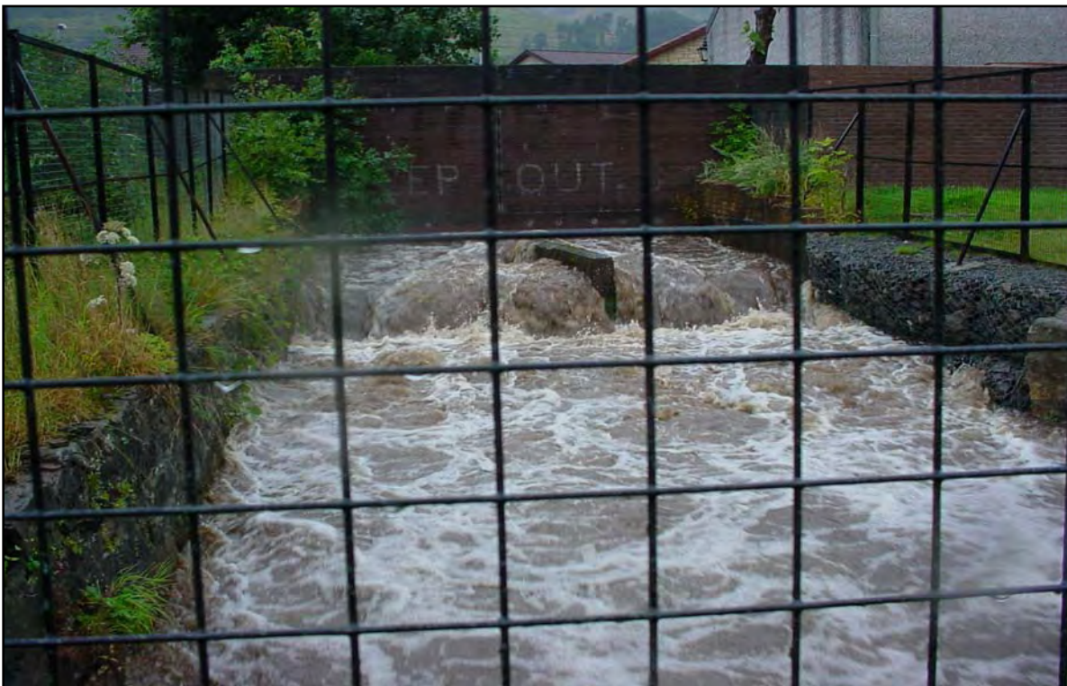
Photo 11 – Alva Burn looking north in Alva Primary School - 09/08/04