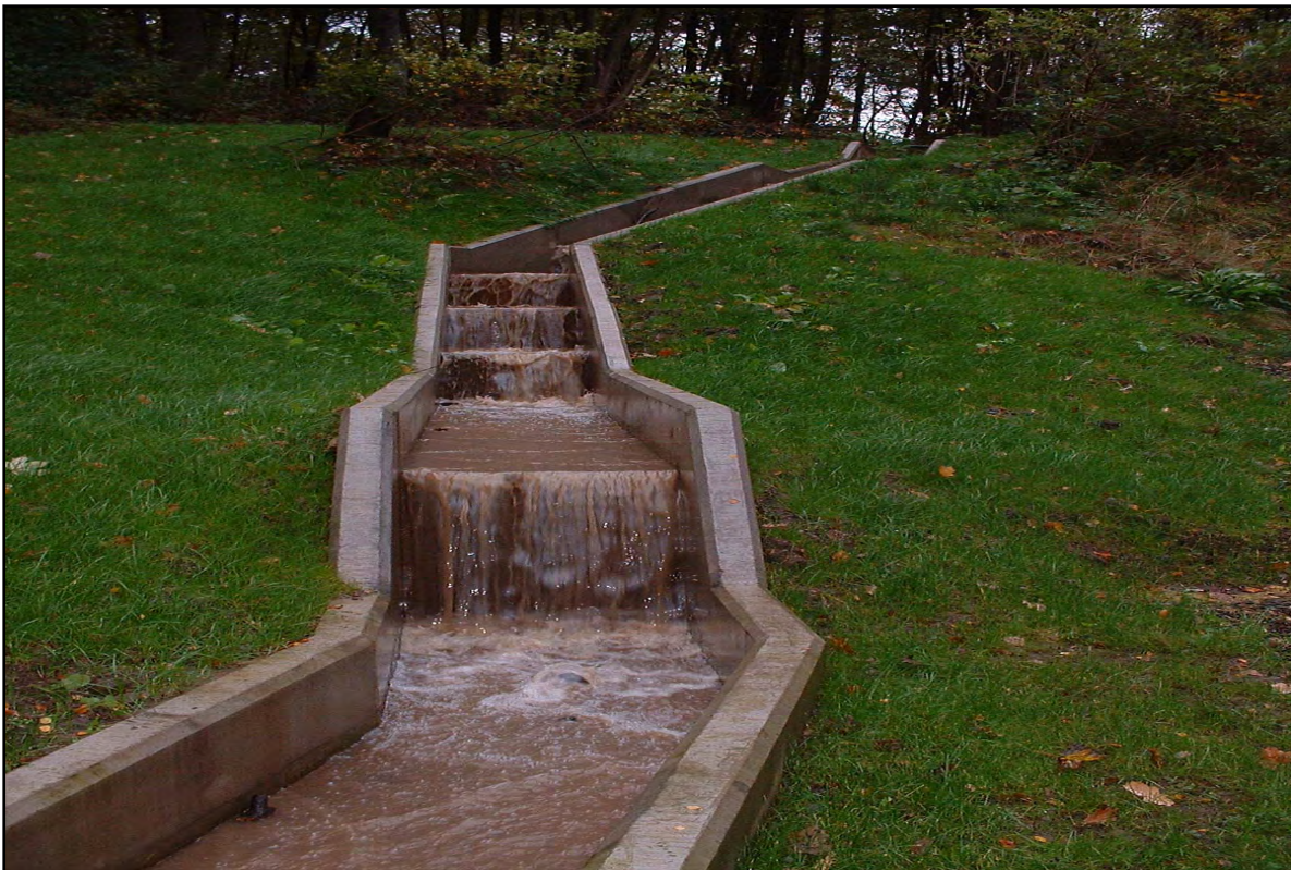
Photo 10 – Part of New Watercourse Capture System at Inglewood, Alloa - 21/10/04