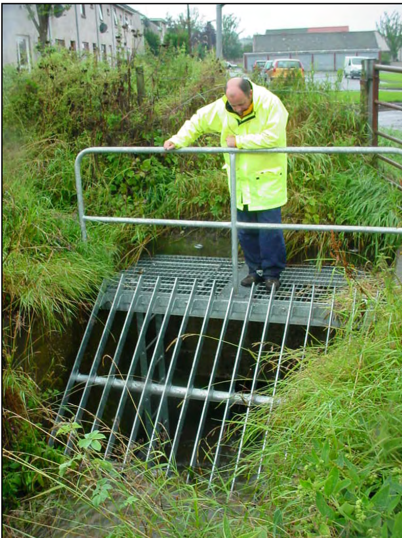
Photo 12 - New Trash Screen at Sauchie Burn Culvert - 10/08/04