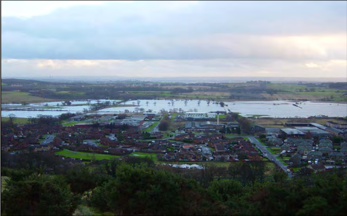
Alva from the Ochil Hills during the Flood Event of 10 th January 2005