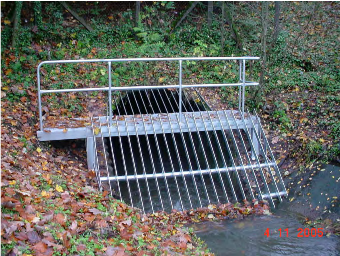
Photo 5 – Brothie Burn at Shillinghill Culvert, Alloa – recently replaced trash screen - 04/11/05