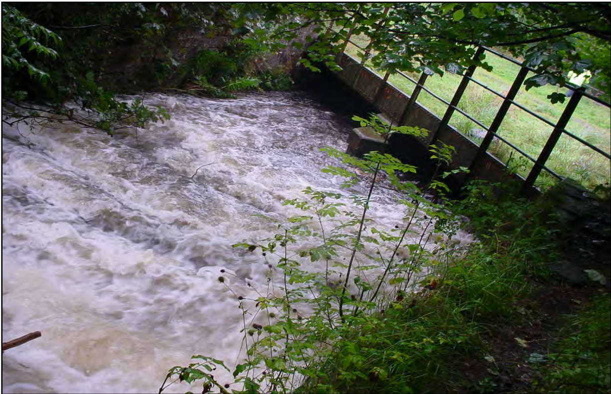
Photo 3 – Dollar Burn at Old Railway Line looking south - 10/08/04

each settlement vulnerable to flood events.